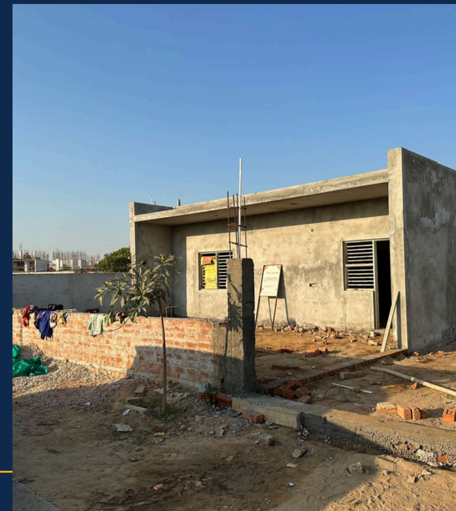
800 Sq Yards Villa, DLF Garden City