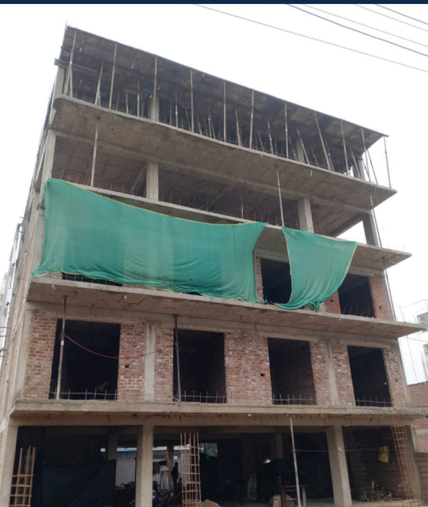
360 Sq Yards, Sector 39, Gurgaon