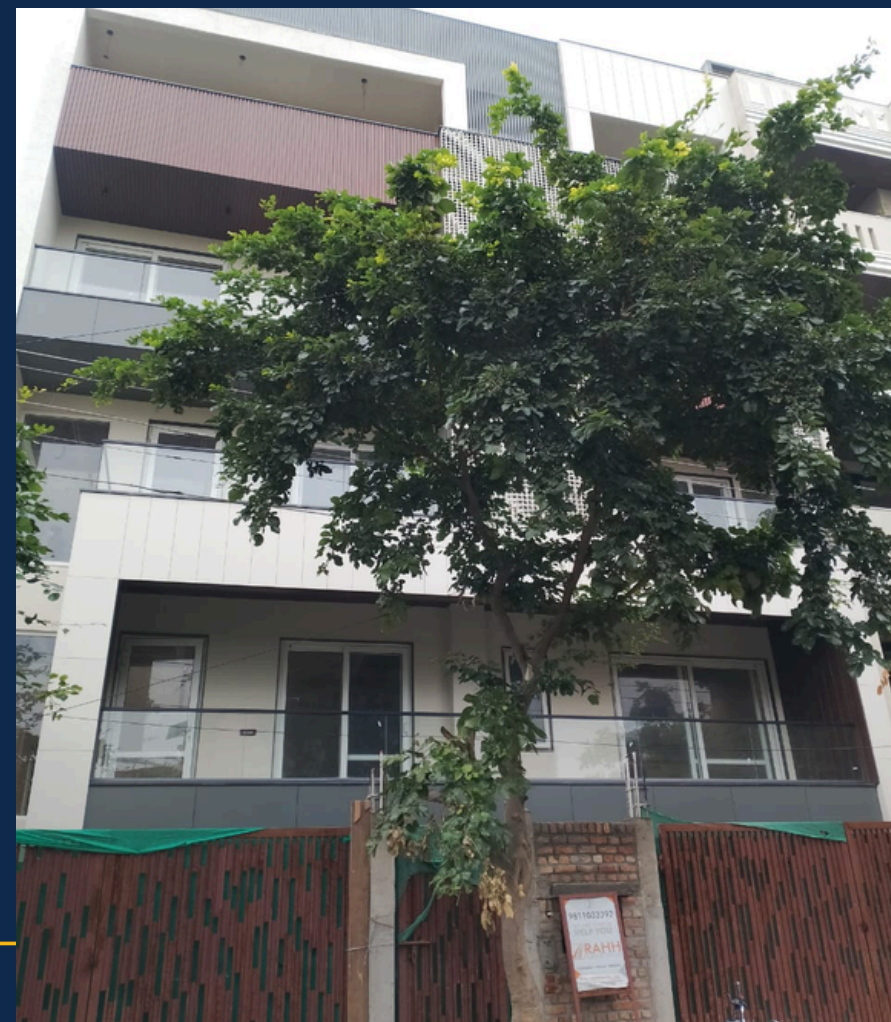
500 Sq Yards, Sushant Lok - 1