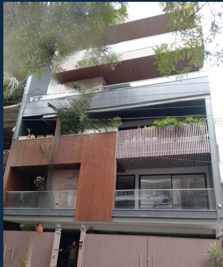
316 Sq Yards - DLF Phase -2, Gurgaon Atul Aggarwal