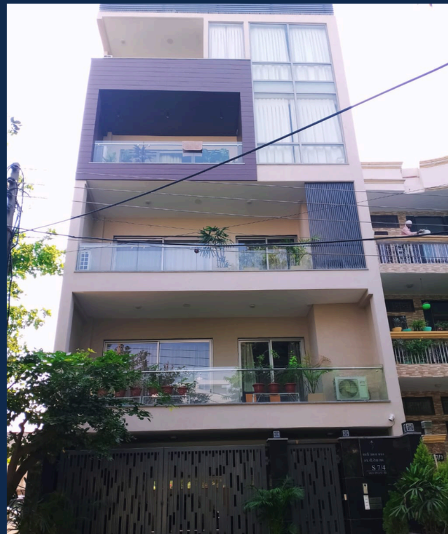
215 Sq Yards - DLF Phase - 3, Gurgaon