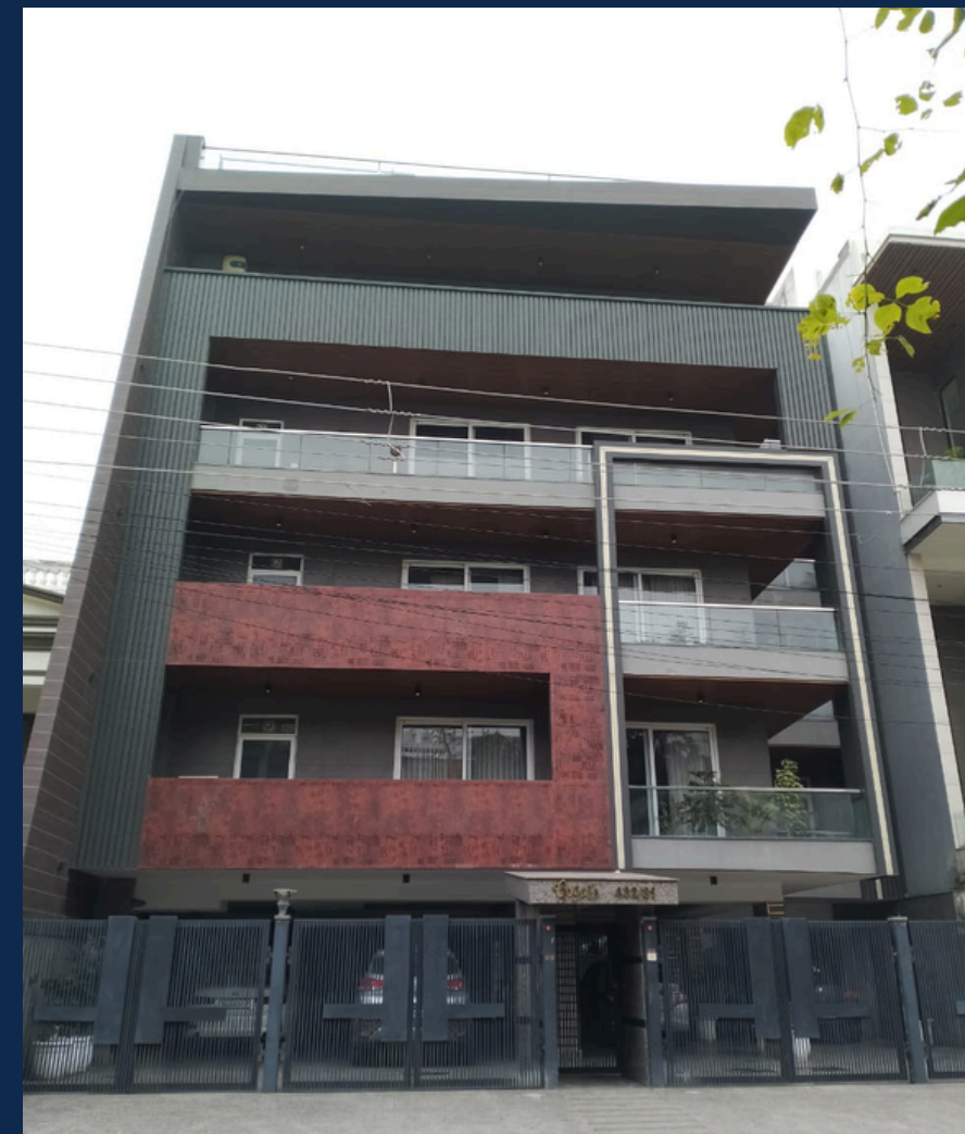
500 Sq Yards - Sector - 31, Gurgaon Jitender Aggarwal