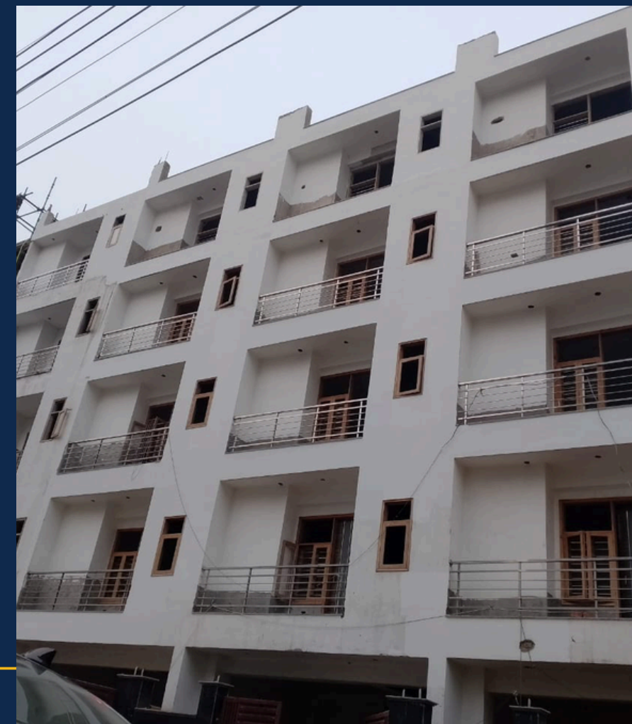
500 Sq Yards, Sector 42, Gurgaon