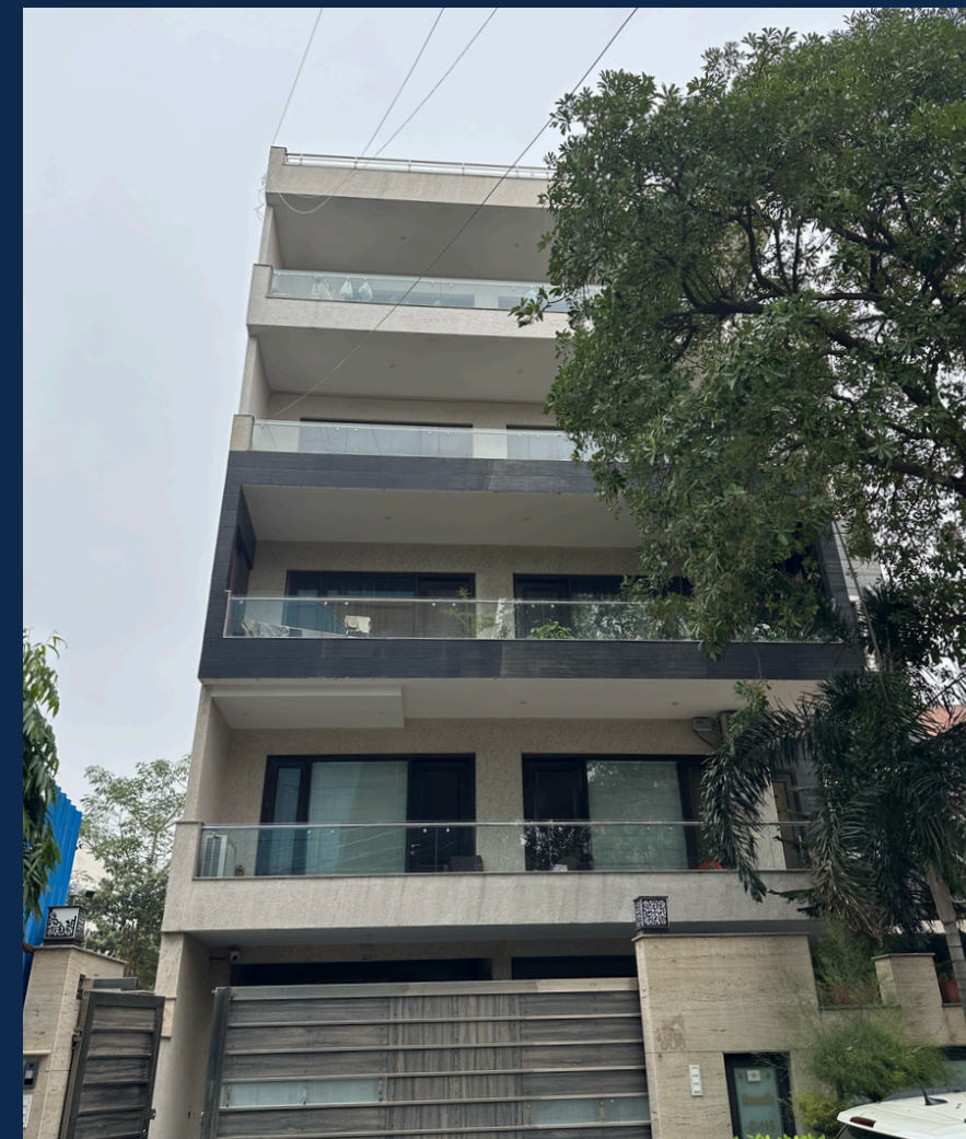
360 Sq Yards, South City -1 Gurgaon