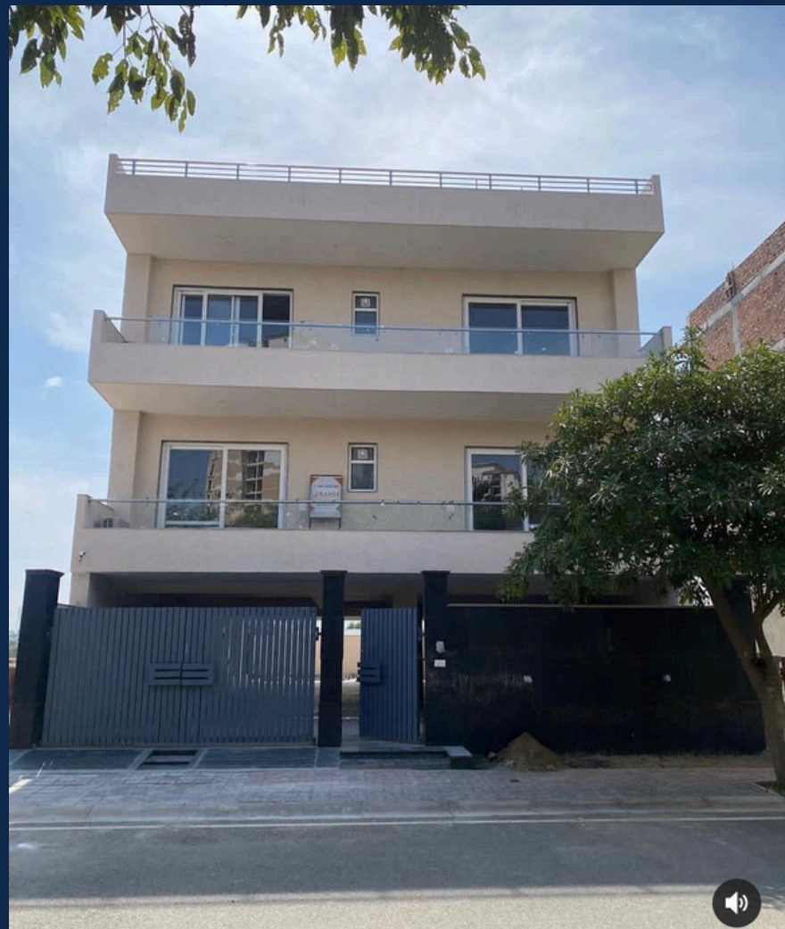
350 Sq Yards - DLF Garden City Gurgaon